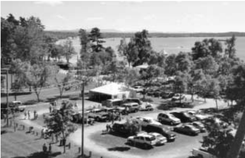
Lake Champlain provides a pleasing backdrop for the Northeast Public Power Rodeo held in Burlington, Vt.

Warm sunshine and blue skies provided the perfect backdrop for the Northeast Public Power Lineworkers Rodeo, held on Sept. 6 in Burlington, Vt. on the shores of Lake Champlain. The event, now in its