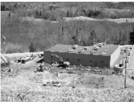
WEC's Landfill Methane Project in Coventry, Vt.

Four New Englanders attended the National Rural Electric Cooperative Associations 2005 Connect Conference & Expo. The event, which was partnered by Touchstone Energy Cooperative, provided an opportunity for cooperative marketing, communications and member service professionals to discover new ideas and strategies, consider new angles and connect with colleagues from